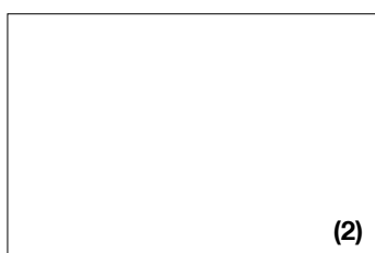
Front side fastening bar